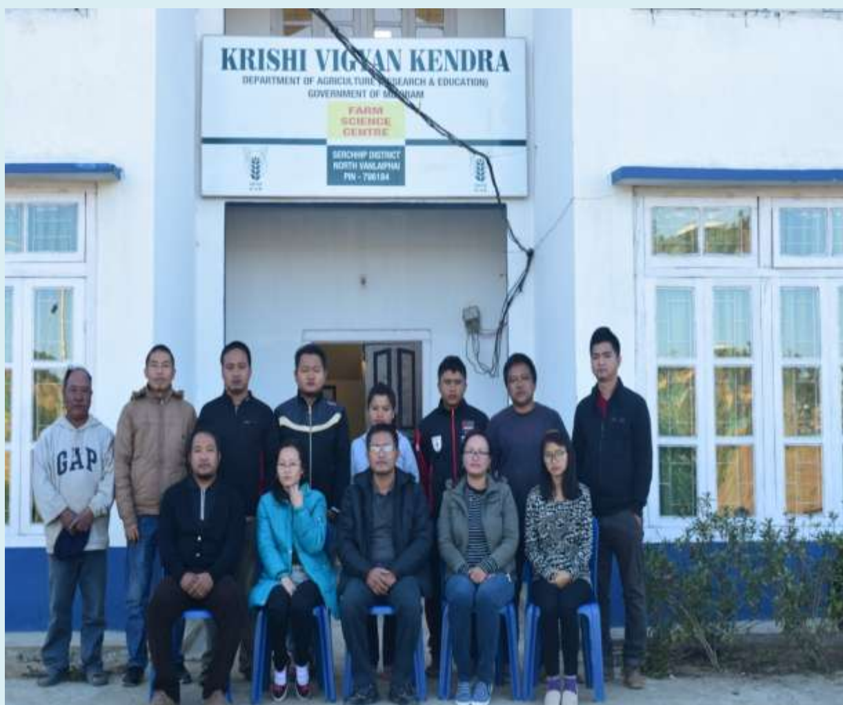
Group Photo of Staffs, kvk serchip